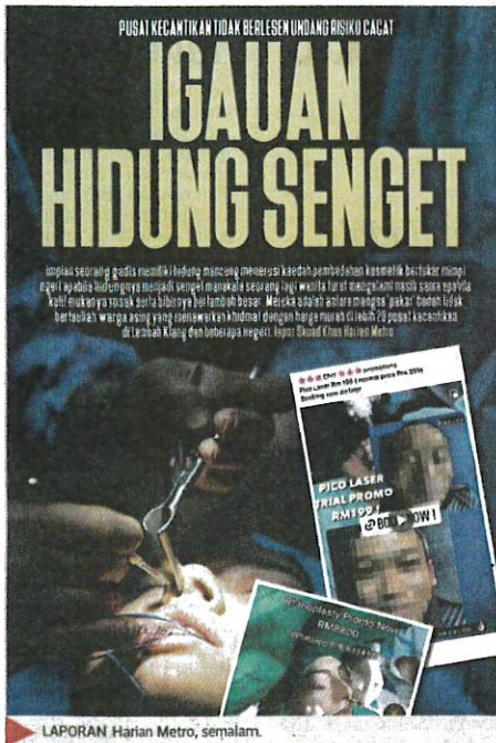
LAPORAN Harian Metro, semalam.

"Pengamal perubatan terbahit mesti mengikuti langkah disenaraikan untuk menjadi doktor perubatan estetik diperakui," katanya ketika