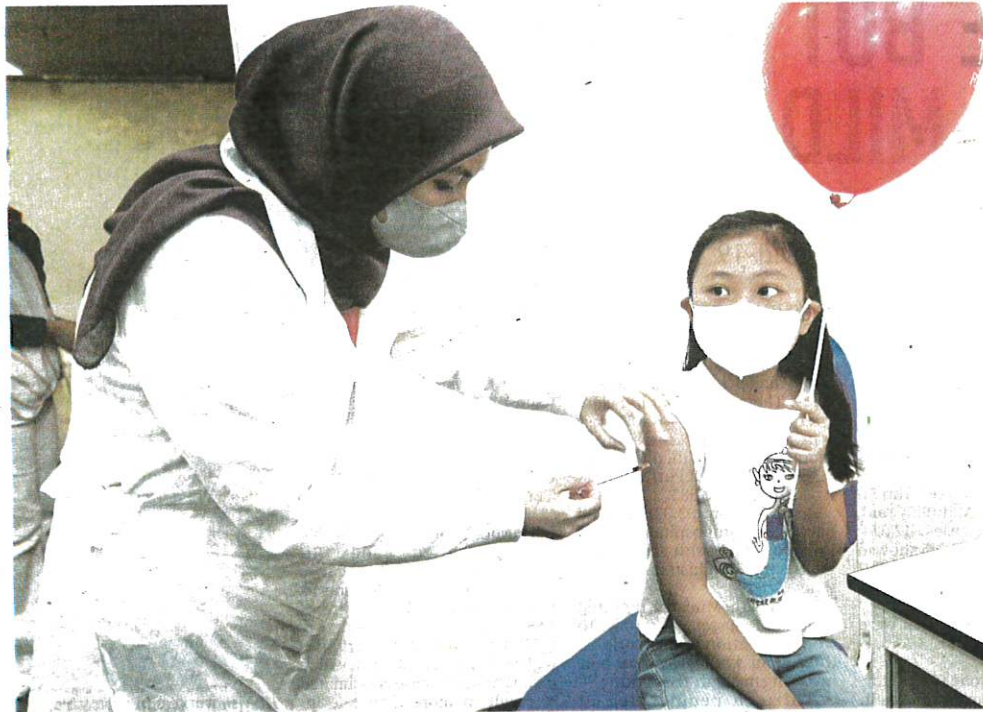
A girl with a balloon getting a Covid-19 vaccine jab at the Axiata Arena vaccination centre in Bukit Jalil, Kuala Lumpur, yesterday.

"Data we have collected has shown that of the nearly 200 children admitted into the ICU since Nov 1 last year until Jan 31 this year, seven deaths had been reported, linked to MISC after Covid-19 infection," she said at a