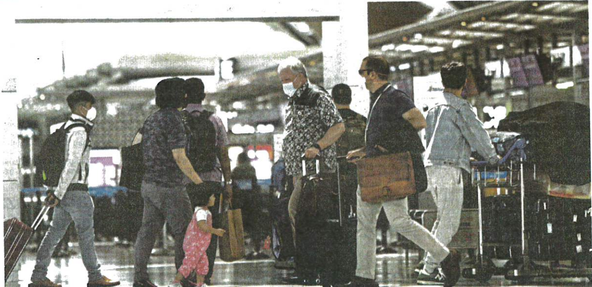
LANGKAH pembukaan sempadan boleh membantu memulihkan sektor pelancongan perubatan yang menjana RM1.7 bilion kepada negara pada 2019.

Kelmarin, Pengerusi MPN Tan Sri Muhyiddin Yassin