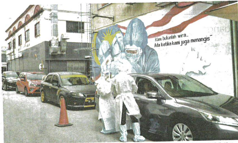
PETUGAS kesihatan melakukan ujian saringan Covid-19 terhadap orang awam secara pandu lalu di Klinik Ajwa, Seksyen 7, Shah Alam semalam.

"Kategori 3 (jangkitan paru-paru) 58 kes atau 0.34 peratus, kategori 4 (jangkitan paru-paru dan memerlukan oksigen) 24 kes