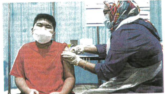
Kanak-kanak menerima suntikan vaksin menerusi PICKids di Pusat Pemberian Vaksin Melaka Megamall, semalam.

COVIDNOW setakat kelmarin, sebanyak 50,062 dos pertama vaksin sudah diberikan kepada kumpulan kanak-kanak terbabit.