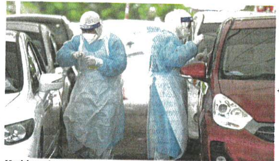
Health workers in protective gear swabbing people at a drive-in Covid-19 testing hub in Dewan Besar Sungai Dua, Tasek Gelugor.

All states and federal territories registered an Rt of above 1, which means that each case is estimated to result in more than one infection.