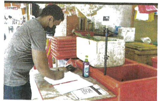
SEORANG pelanggan menulis maklumat diri di dalam buku rekod daftar masuk di sebuah premis di Kuala Lumpur semalam.

"Bagi populasi remaja berusia antara 12 hingga 17 tahun pula, sejumlah 2,792,830 atau 88.7 peratus daripada populasi kumpulan itu melengkapkan vaksinasi, manakala 2,870,546 individu atau 91.2 peratus menerima sekurang-kurangnya satu dos vaksin," katanya.