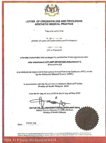
SIJIL LCP yang dikeluarkan KKM.