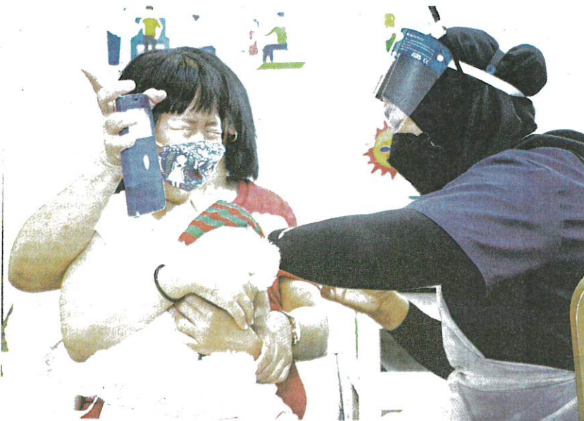
SEORANG kanak-kanak menangis ketika menerima suntikan vaksin di Pusat Dagangan Dunia (WTC) Kuala Lumpur kelmarin.

Kelmarin, Menteri Kanan Pertahanan, Datuk Seri Hishammuddin Tun Hussein mengumumkan, SOP berkaitan pemeriksaan suhu badan dan buku rekod daftar masuk akan dimansuhkan bermula esok.