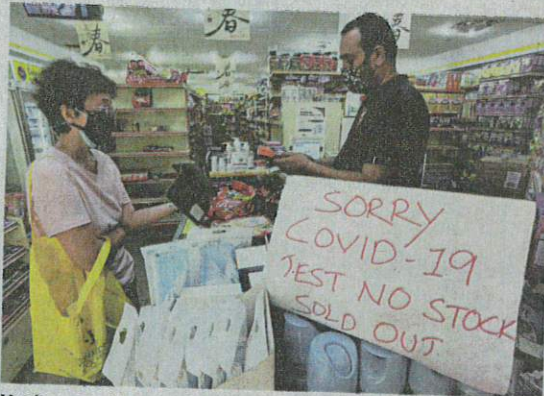
Hot item: Covid-19 test kits have been selling like hotcakes due to the rising number of cases.

"I suppose people feel a sense of security when the self-test kits show a negative result and that is why