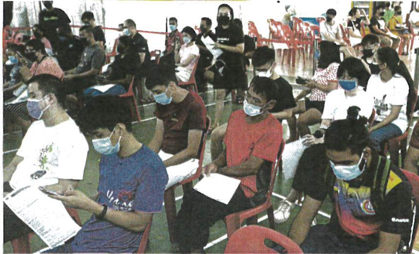
People waiting to be vaccinated against Covid-19 at Dewan Ang Si Chong in Butterworth, Penang, yesterday.

AKHBAR : NEW STRAITS TIMES MUKA SURAT : 2 RUANGAN : NEWS / STORY OF THE DAY