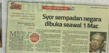
Laporan Sinar Harian pada Rabu.

Beliau bagaimanapun berkata, isu tersebut tidak perlu dibimbangi sekiranya majoriti rakyat Malaysia telah me-