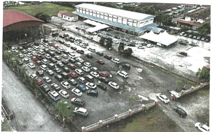
People waiting to be tested for Covid-19 at a drive-in testing hub in Dewan Besar Sungai Dua, Tasek Gelugor, in Penang yesterday.

Thirteen people died of Covid-19 yesterday, including